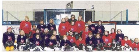
"I have never seen my son watch a hockey camp with such envy."